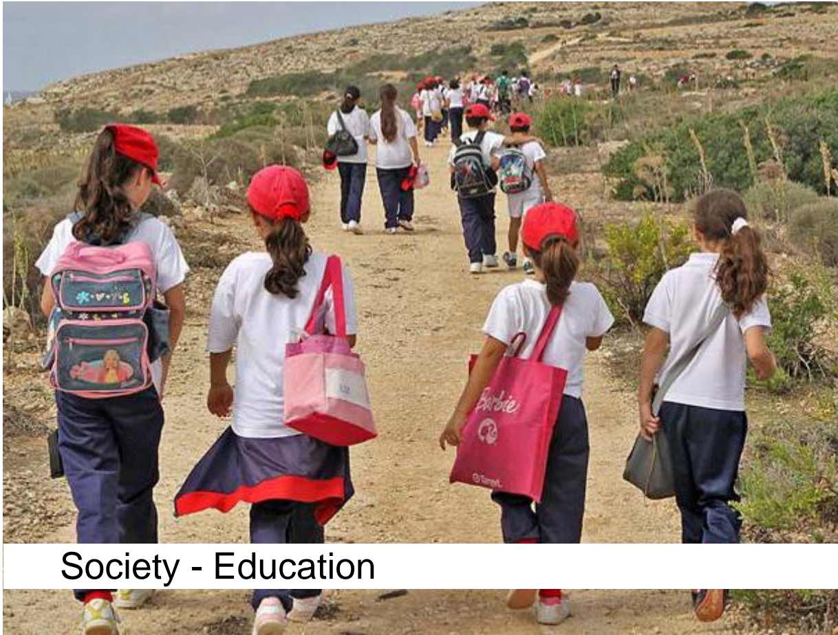
Society - Education